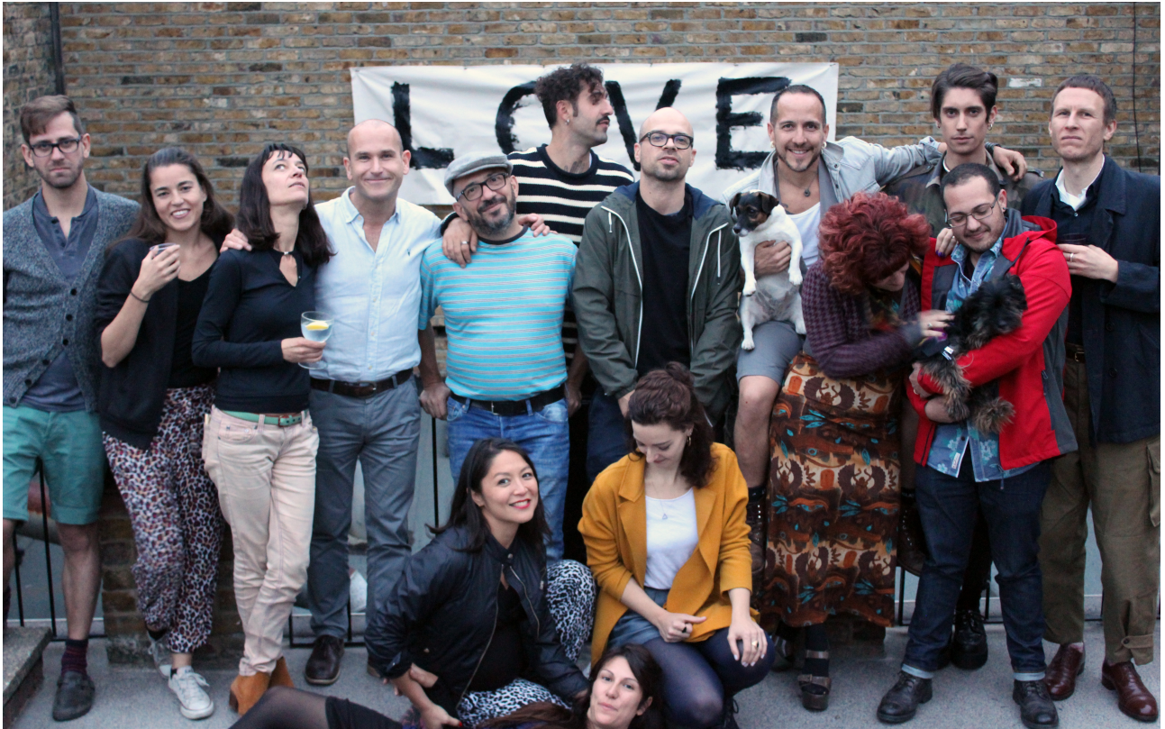
'semantic' – title: love

– An emotion, an instinct to evolve in choices. A synonymous of freedom and contrary of fear. But I'm working on it!